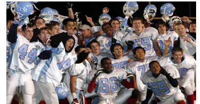
MARSHALL BEATS MADISON, FINISHES 7-3 AND IN THE PLAYOFFS!

Will Marshall do it again? Come out and cheer for your favorite High School!