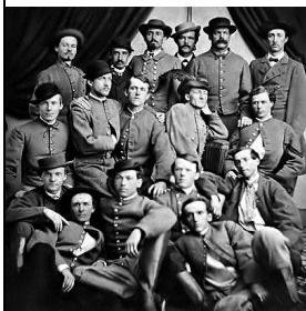
This is an old photograph of the Mosby Raiders. The picture was taken between 1861 and 1865.

Today's Program Tom Hovis Mosby's Raiders